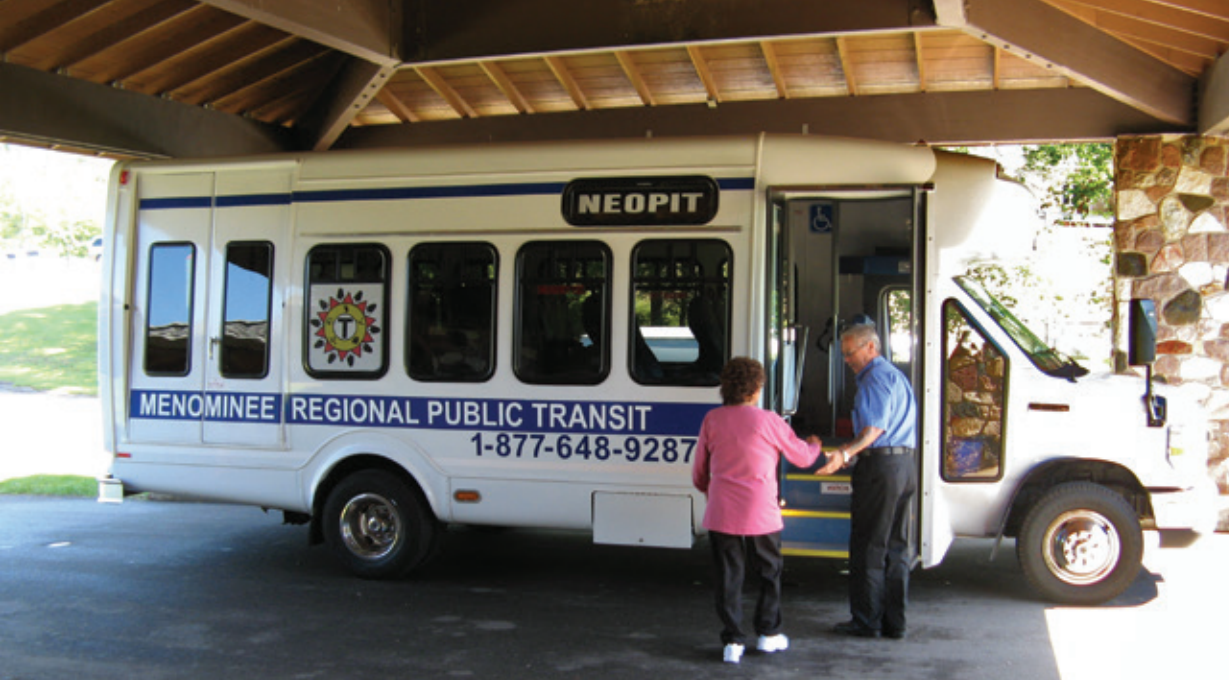
A Menominee Regional Public Transit driver assists a passenger at the Tribal Health Clinic, Keshena, Wisconsin.

it was reported that only 18 of 562 federally recognized tribes received any funding from the Federal Transit Administration (FTA) rural transit program.